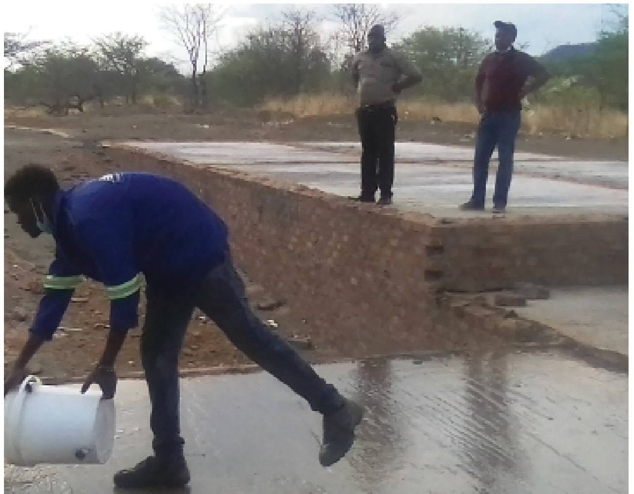
Work on the ECD block