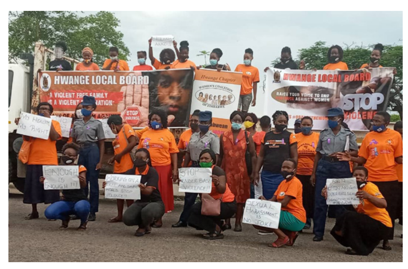
Women pose for a photo during the Activism against Gender-Based Violence roadshow in Hwange

Miss Moyo further emphasised that the 16 Days of Activism were meant raise spotlight on GBV while also providing an opportunity for communities to stand together and encourage conversations on preventing and eradicating