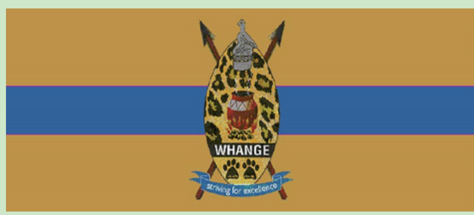
The flag dessigns which the council has to choose from

WANGE Local Board (HLB) will soon unveil its corporate flag as a way of enhancing its identity to stakeholders.