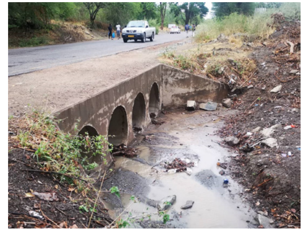
Council workers clear culverts in Hwange suburbs

WANGE Local Board (HLB) is working on coming up with a long lasting solution aimed at curbing perennial floods in particular areas at two of its suburbs.