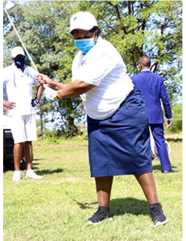
First Lady Amai Auxillia Mnangagwa takes a swing