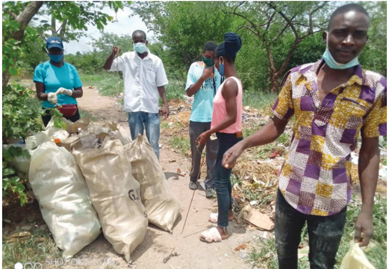
Green Shango Environment Trust members picking up litter in Empumalanga

Of late the local authority has been battling to curb illegal solid waste dumping which has been on the increase in residential areas and along main roads.